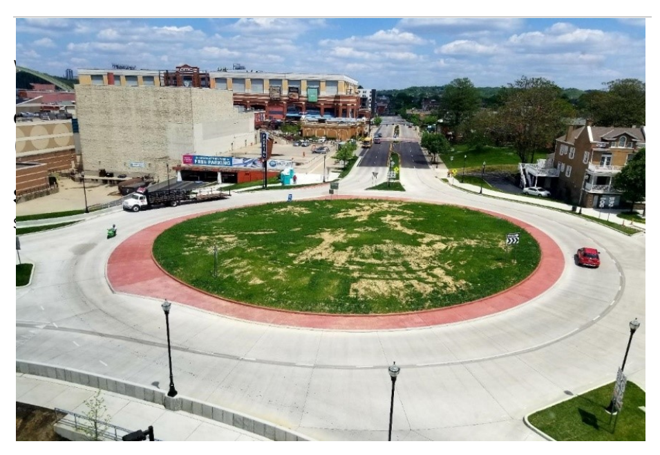
Final Arial of Small Roundabout

Hilltop Companies, along with PRUS Construction & KYTC, were awarded the "Concrete Design Awards 2018" for their creativity in this project by the Kentucky Concrete Association.