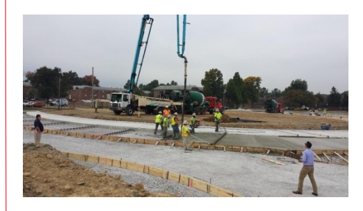
Pouring of Big Roundabout (KY9) October 2016