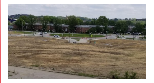
Side view of Final Big Roundabout (KY9) – May 2018

Want to learn more about Hilltop capabilities? Contact us today!