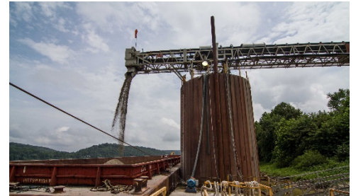
Loading the Barge